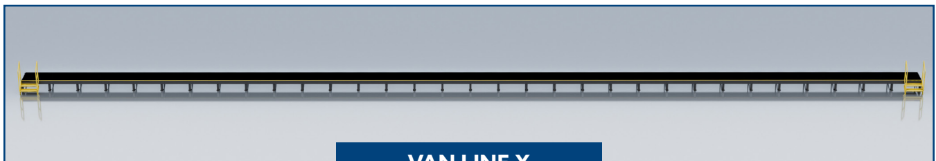
VAN LINE X