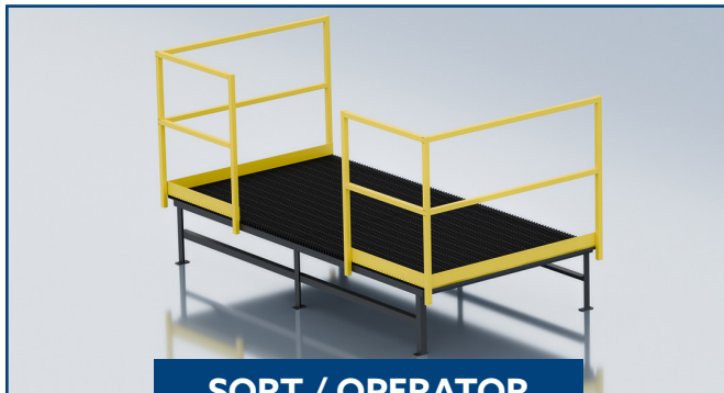
SORT / OPERATOR